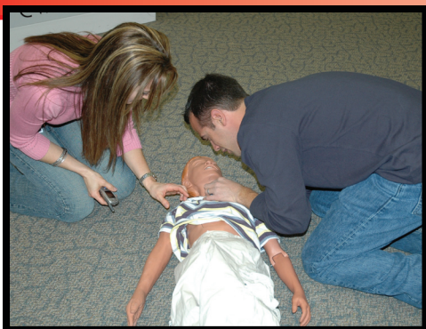
Child falls and 911 is called