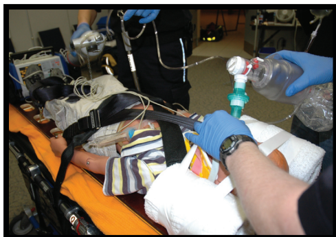
Patient is treated and taken to hospital