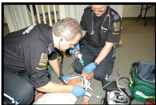
Emergency crews arrive and assess the situation