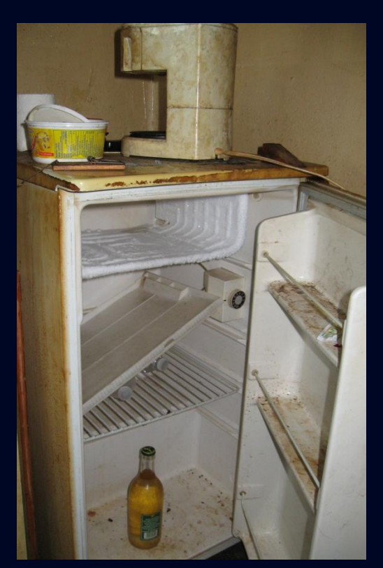
Impoverished; no social support; isolated